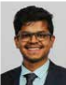
Prithvi Chauhan Events Planning